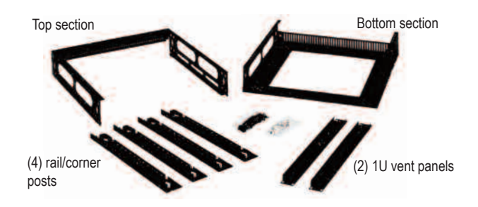
X-series racks ship unassembled.

The rack shall be Lowell X-Series rack Model ______ with an overall size of ______. The rack frame shall be 14 gauge US steel with four threaded rack rail/corner posts, 1-piece top section, 1-piece bottom section, (2) 1U vent panels, and hardware. Finish shall be black powder epoxy. Optional: The rack shall include expansion kit Model ______, middle depth rail set Model ______, side panels Model ______, top panel Model _SP-10_, and caster set Model _XCS_ with 125 lbs. load capacity per caster.