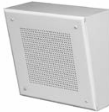
Model DSL-810-72 has an acoustic-lined backbox with a sloped front.

Speaker assembly for surface mount indoor applications shall be Lowell Model _____ (DSL-810-72 or DSQ-810-72). Assembly shall include a 15W dual cone driver with dual voltage transformer and square grille mounted within a steel housing (slope-front or square). The housing shall be lined with 1.5" thick acoustic batting and have wiremold knockouts top and bottom and a universal mounting hole pattern on the rear. Speaker shall have a frequency response of 47Hz - 20kHz \pm 6dB and an average sensitivity of 95dB. Transformer shall be dual voltage (70V / 25V) with power taps at 0.25, 0.5, 1, 2, and 5 watts with color coded leads. The housing and grille shall be finished in durable powder epoxy paint.