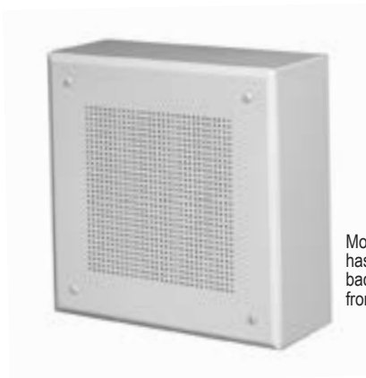
Model DSQ-810-72 has an acoustic-lined backbox with a square front.