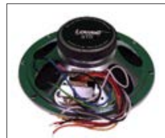
Both styles feature the dual cone driver with a mounted transformer.