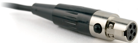
TA5F connector for Lectrosonics transmitters

These adapters allow microphones with TA5F connectors wired for Lectrosonics transmitters to be used with the MM Series miniature transmitters. Two versions are provided for 2-wire and 3-wire microphones.