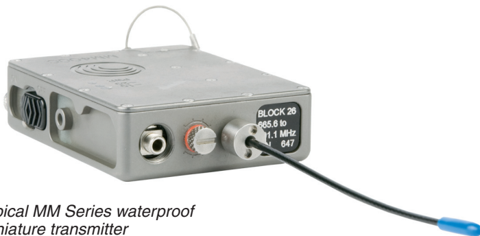
Typical MM Series waterproof miniature transmitter

For 2-wire lavalier microphones with TA5F connectors wired for Lectrosonics transmitters.