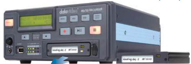
Removable hard drive