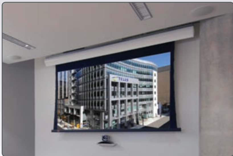
Telus House conference room—Ottawa, Ontario. LEED® Silver Certified.