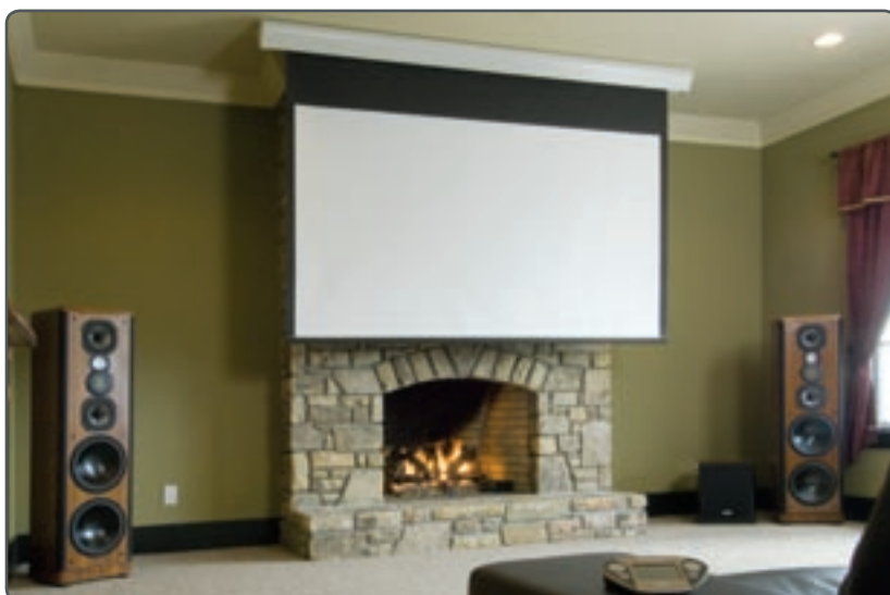
Installer/Dealer/Designer: Harmony Interiors, Asheville, NC