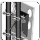
TPP Flat Panel Tilt Truss Mount