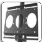
TPK1/TPK2 Pole Kits (TPK 2 shown)