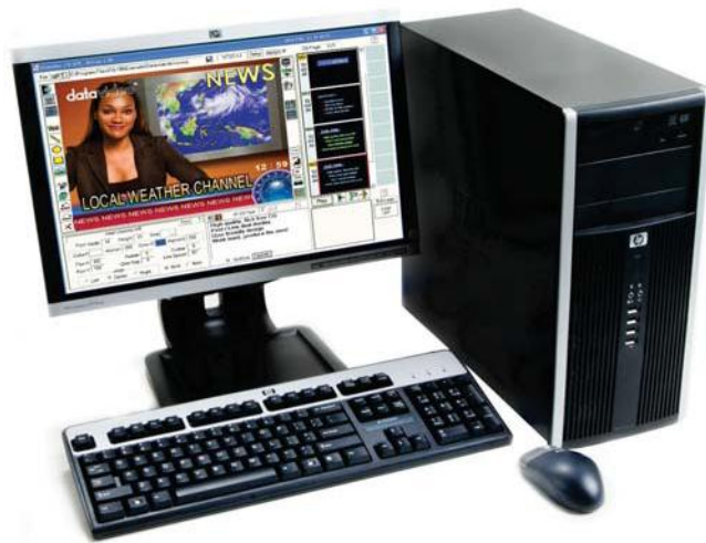
Decklink SDI card and the SE-800 w/SDI