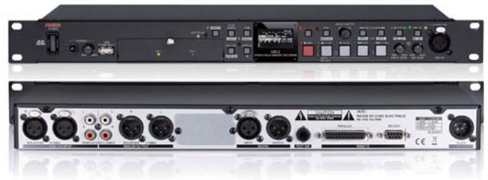
UR-2 STEREO RACK MEMORY RECORDER