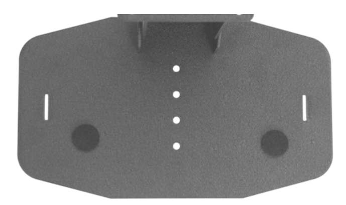
Figure 2. Install Felt Pads