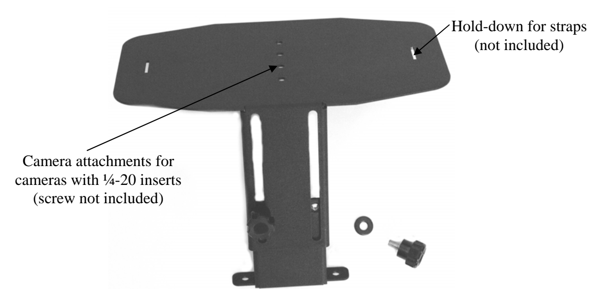
Figure 3. Attach Plate to Shelf