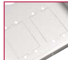
Electrical box knockouts