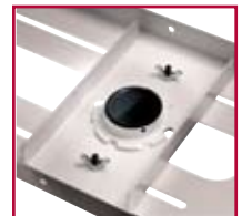
Carriage and wing nuts