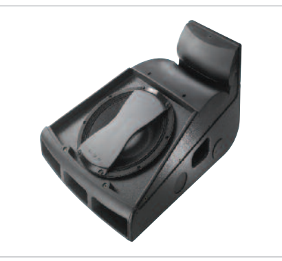
Waveguide forms a 'smile' to eliminate wavefront interference when monitor is arrayed.