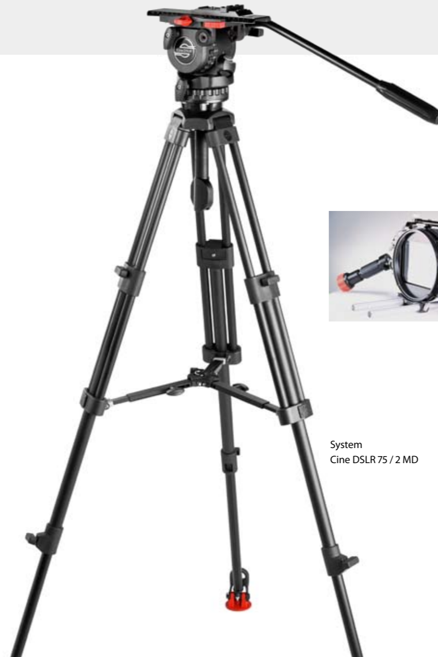
System Cine DSLR 75 / 2 MD