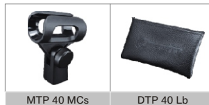
MTP 40 MCs