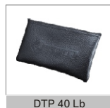
DTP 40 Lb