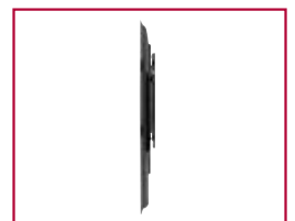
Flat against the wall