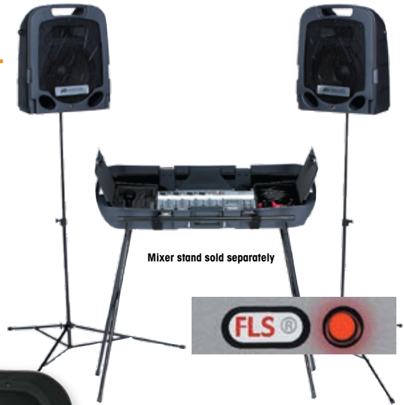
Mixer stand sold separately