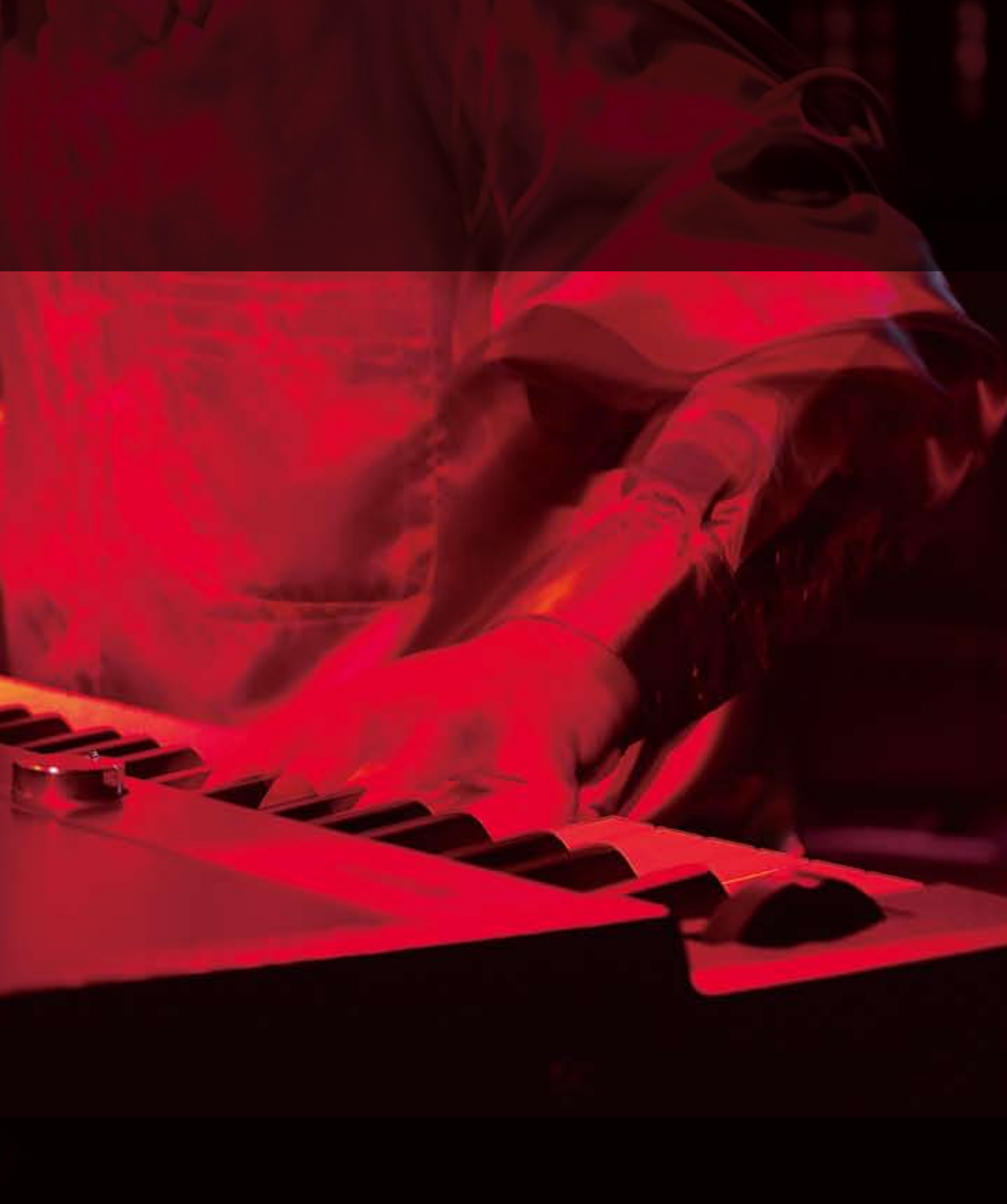
Touch and Tone to satisfy the most demanding professional. The new CP series the ultimate in Stage Pianos.