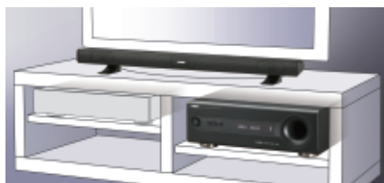
The YHT-S400 fits neatly in and on top of a rack