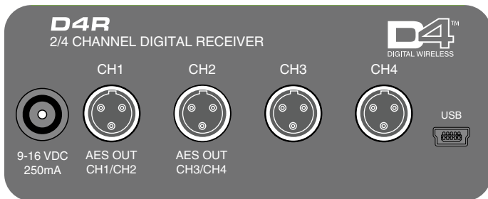
D4R Rear Panel