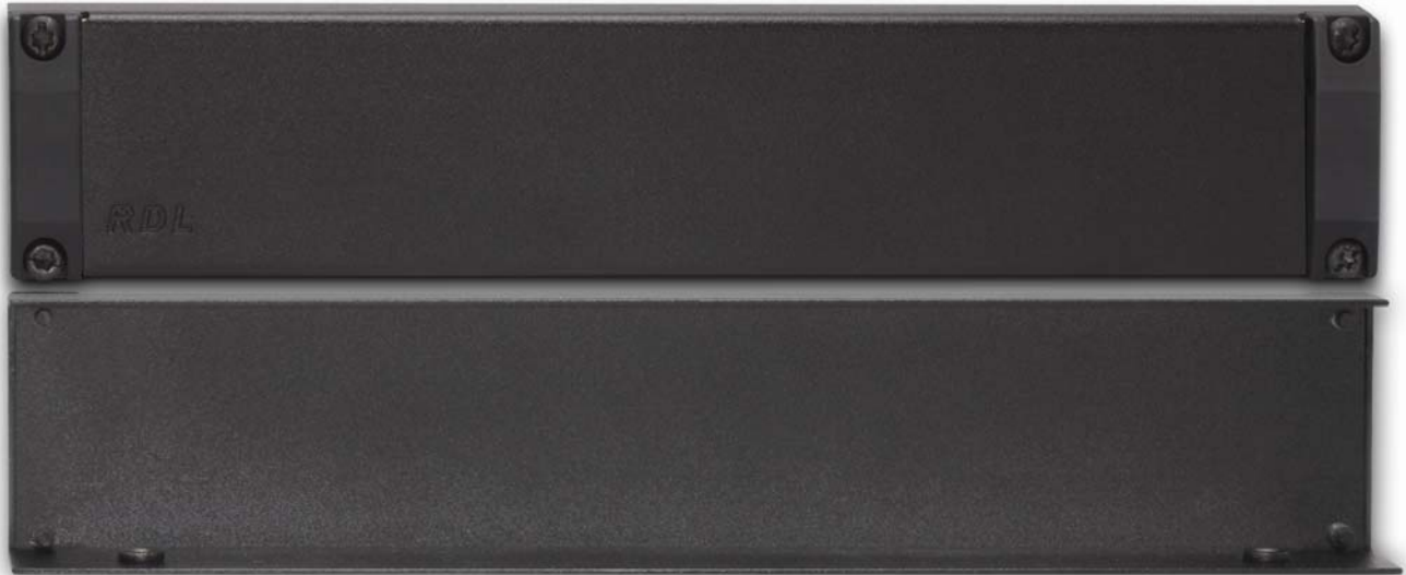
HR-FP1 Filler Panel