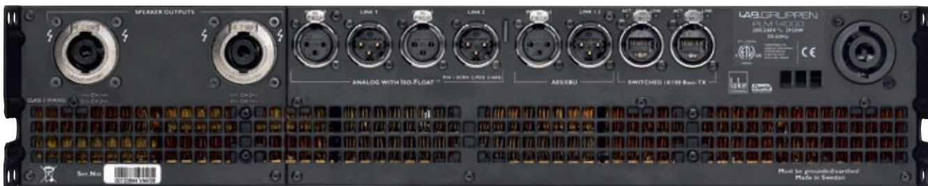
PLM 14000 Neutrik Speakon connector version shown.

The PLM Series Powered Loudspeaker Management systems are equipped as standard with Dante, a self-configuring digital audio networking solution from Audinate® of Australia. Based on the newest developments in networking technology, Dante provides reliable, sample-accurate audio distribution over Ethernet with extremely low latency. Dante incorporates Zen™, an automatic device discovery and system configuration protocol which enables PLM Series products and other products with Dante (like Dolby Lake Processors) to find each other on the network and configure themselves.