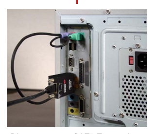
Direct connect CAT5 Transmitter streamlines your installation

Europe and Asia, Rose provides a full range of capabilities and support. Call us today for more information about this and other Rose products.