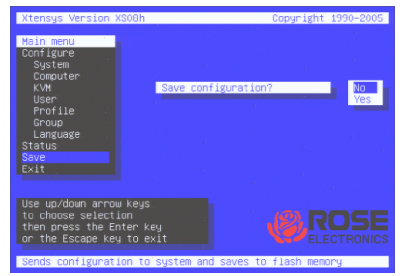
Easy to use OSD for configuration

■ Phone: 281-933-7673 ■ E-mail: sales@rose.com ■