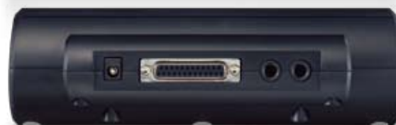
■ Rear Panel