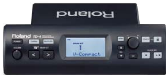
■ Front Panel