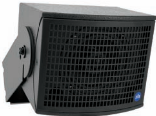
SGX41 with UBRKT/41 U-Bracket