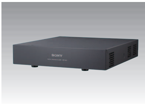
VSP-NS7 Digital Signage Player