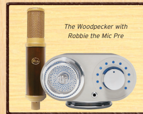
The Woodpecker with Robbie the Mic Pre

The Woodpecker was designed to provide the smooth, intimate sound associated with the most sought-after (and expensive) vintage ribbon microphones. With its focused mid-range and outstanding bass response, the Woodpecker captures the essence of any recorded sound. The Woodpecker also excels at ambient recording, capturing room tone with the most intimate detail – whether for rock drums, guitars or vocals – any application where some natural space in the recording is desired.