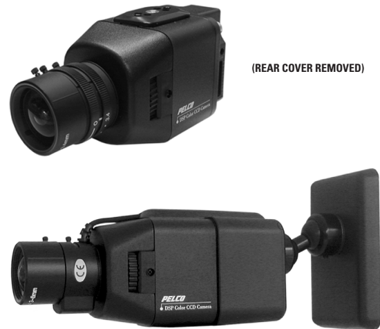
(REAR COVER REMOVED)

The CC3701H-2 Series digital color camera is smaller than most other full-featured CCD cameras. In order to keep the camera as small as possible, Pelco engineers designed the camera components to fit within the external dimensions of the unit. Since the BNC, power, and lens connectors stay within the boundaries of the case, the compact camera and a lens fit perfectly inside one of Pelco's smaller enclosures (EH100, EH3508, EH2508, EH2020, EH2100, and EH2200). Pelco also has a wide selection of fixed and varifocal lenses available to meet your installation requirements.