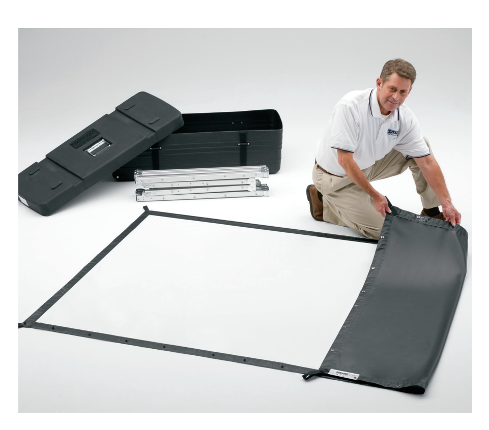
Foldable Black Backed Da-Mat® Fabric