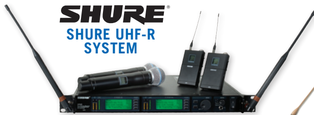
SHURE SHURE UHF-R SYSTEM