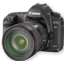
Canon CANON EOS 5D MKII DIGITAL SLR CAMERA