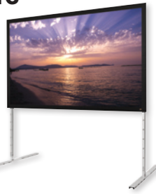
DRAPER DRAPER FOCAL POINT