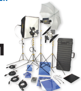
LOWEL LOWEL DV CREATOR 55 KIT