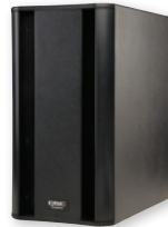
QSC KSUB POWERED SUBWOOFER