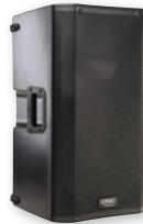
QSC K12 POWERED SPEAKER