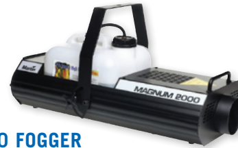
MARTIN MAGNUM 2000 FOGGER