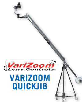
VariZoom Lens Controls VARIZOOM QUICKJIB