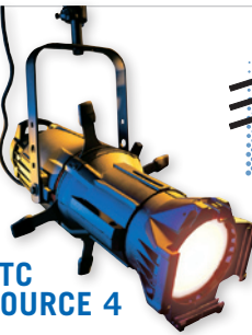
ETC SOURCE 4