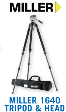
MILLER MILLER 1640 TRIPOD & HEAD