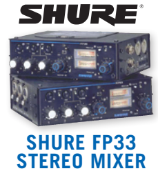
SHURE SHURE FP33 STEREO MIXER