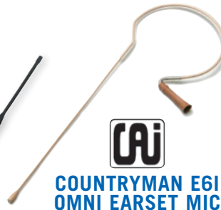
CAI COUNTRYMAN E61 OMNI EARSET MIC