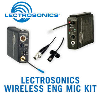
LECTROSONICS LECTROSONICS WIRELESS ENG MIC KIT