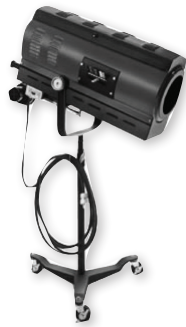
ALTMAN Lighting, Inc. ALTMAN 1000Q FOLLOW SPOT