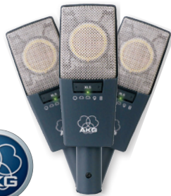
AKG C414 CONDENSER MIC