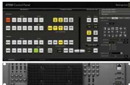
ATEM PRODUCTION SWITCHER SOFTWARE INTERFACE

BLACKMAGIC DESIGN ATEM PRODUCTION SWITCHERS Both the 1 M/E and 2 M/E are compact, portable production switchers. Control the switchers with the software control panel via a Mac or PC laptop or the dedicated broadcast panels. The 1 M/E has (4) SDI inputs, (4) HDMI inputs, analog input, USB 3.0, frame resynchronizer, DVE transitions, 6 keyers, multiview and more. The 2 M/E has (12) SDI inputs, (4) HDMI inputs, analog input and USB 3.0. Other features of the 2 M/E include SuperSource multi-layering composite engine, 2 multiview outputs and a second M/E row.