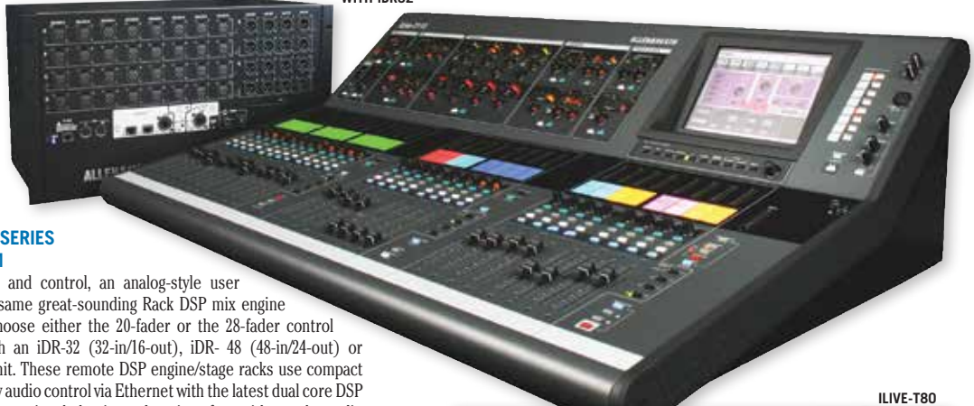
iLIVE-T112 WITH IDR32