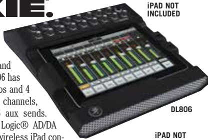
iPAD NOT INCLUDED

Full-featured digital mixers combined with the ease and mobility of an iPad®. The DL806 has 8 channels, 8 Onyx mic preamps and 4 aux sends, the DL1608 has 16 channels, 16 Onyx mic preamps and 6 aux sends. Both feature a 24-bit Cirrus Logic® AD/DA converter. Seamless wired or wireless iPad control allows mixing from anywhere in the venue with the ability to support up to 10 iPads simultaneously. This gives the ability to control not only the mix, but also plug-ins like EQ, dynamics, effects and more. Plug-ins on each channel include 4-band EQ, compression, gate, reverb and tap delay. The main and aux outs include 31-band EQ, graphic EQ and compressor/limiter. Other features include snapshot recall, 6 aux sends, recording/mixing to iPad and more. WiFi is required for remote use. Beginning September 2013, the DL series will switch from the 30-pin connector to the Lightning connector. Conversion kits will be available. Call a Full Compass Sales Pro to ensure that your iPad has the proper connections.