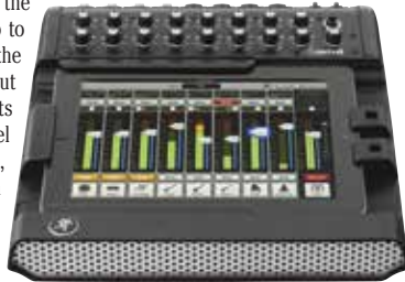
iPAD NOT INCLUDED