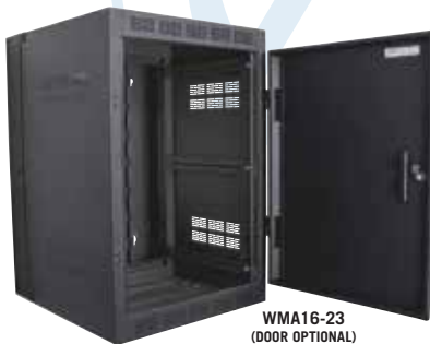
WMA16-23 (DOOR OPTIONAL)

These wall racks feature a side lock security system for a secure method of joining center section to back pan. Construction allows safe installation by one person. Black electrostatic powder coat finish, and mirror image back pan allows left or right hinging of center section regardless of orientation. All models have an 18" depth in the center section, and 23.56" overall depth. Call for information about other optional accessories: rear rails, fan panels, and side-mount fans.