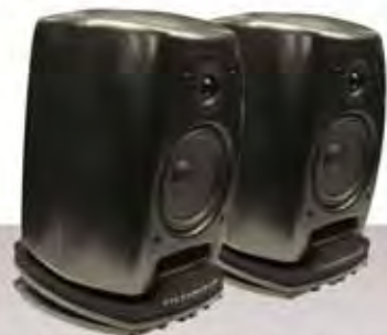
MS-80 Desktop Monitor Stands

You've put your heart and soul into building your studio and your monitors deserve to be set upon pedestals worthy of your effort. Ultimate Support's MS Series studio monitor stands feature state-of-the-art sonic isolation and decoupling components, internal cable management channels, and Series 6000 aluminum for a build and design that's second to none. Your studio deserves the MS Series.