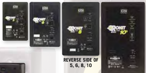
REVERSE SIDE OF 5, 6, 8, 10