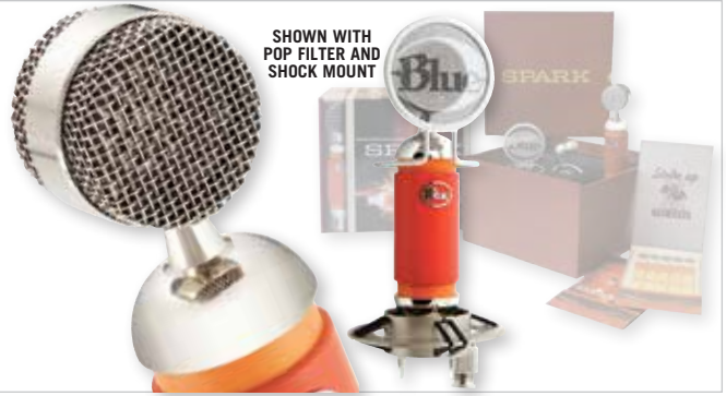
SHOWN WITH POP FILTER AND SHOCK MOUNT