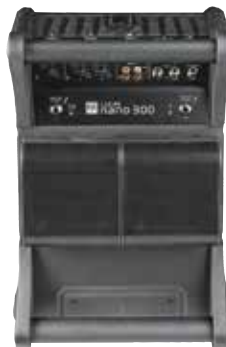
LUCASNANO300 SHOWING STOWED SATELLITES