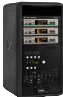
SHOWN WITH WIRELESS MODULES - SOLD SEPARATELY

The LSP-500-PRO boasts up to 3 wireless microphone links, Bluetooth® music streaming and a built-in USB player/recorder for optimum audio connectivity. It uses a 2-way acoustic design with 8" woofer and 3/4" compression driver. Wireless microphone integration is made possible via ew500 series microphones and receivers. The 55W Class 'D' amplifier provides up to 6 hours of operation (3 hours per battery) and its dual batteries are hot-swappable. Remote control via iPad is possible with the free LSP-500-PRO app and a WiFi router (sold separately). Other features include a 3-band semi-parametric EQ and a pole mount socket.