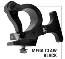
MEGA CLAW BLACK

The aircraft-grade aluminum Mega-Clamp is stronger and lighter than cast iron clamps and can hold loads nearing 2-1/2 tons hung from 1"-2" pipes. The Uni-Bolt fastens fixtures or pipes to 1-5/8" x 1-5/8" strut channels. Mega-Claws are for intelligent lighting fixtures and fit 1-1/2" to 2" pipe. Purlin clamps are for installing purlins, bar joints and I-beams up to 1" thick. Mega-Couplers fasten to 1-1/4" pipe up to 2" truss tube. The Mega-Baby is for hanging location-style lights on a studio grid (1"-2" pipe). The Mini-Baby is similar to the Mega-Baby but has no hairpin and is for 1-1/4"-1-1/2" pipe.