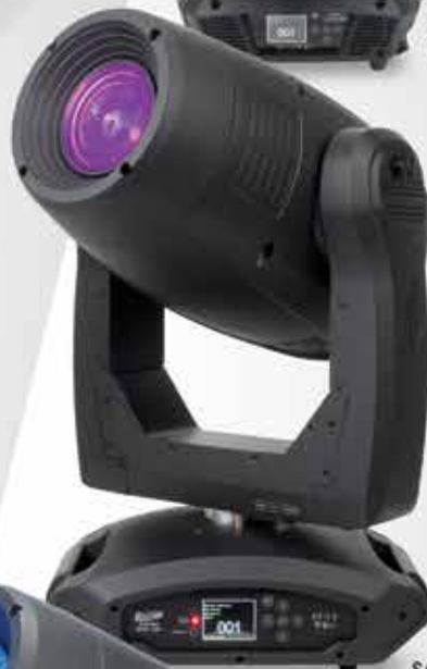
SATURA SPOT CMY PRO COOL WHITE LED ENGINE