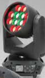
RAYZOR Q12 ZOOM