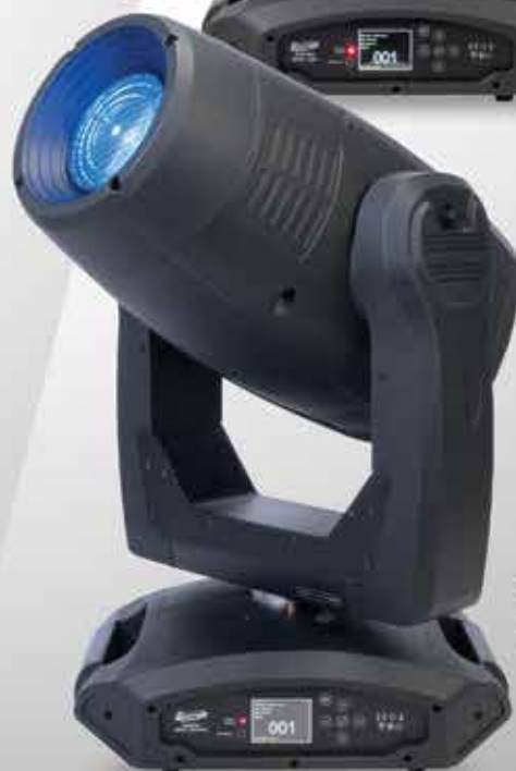
SATURA SPOT LED PRO RGBW LED ENGINE