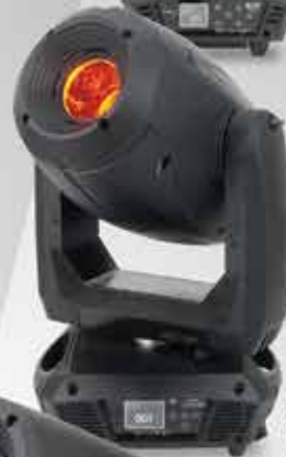
PLATINUM PROFILE LED