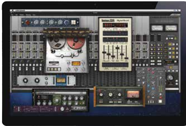
MONITOR SOLD SEPARATELY