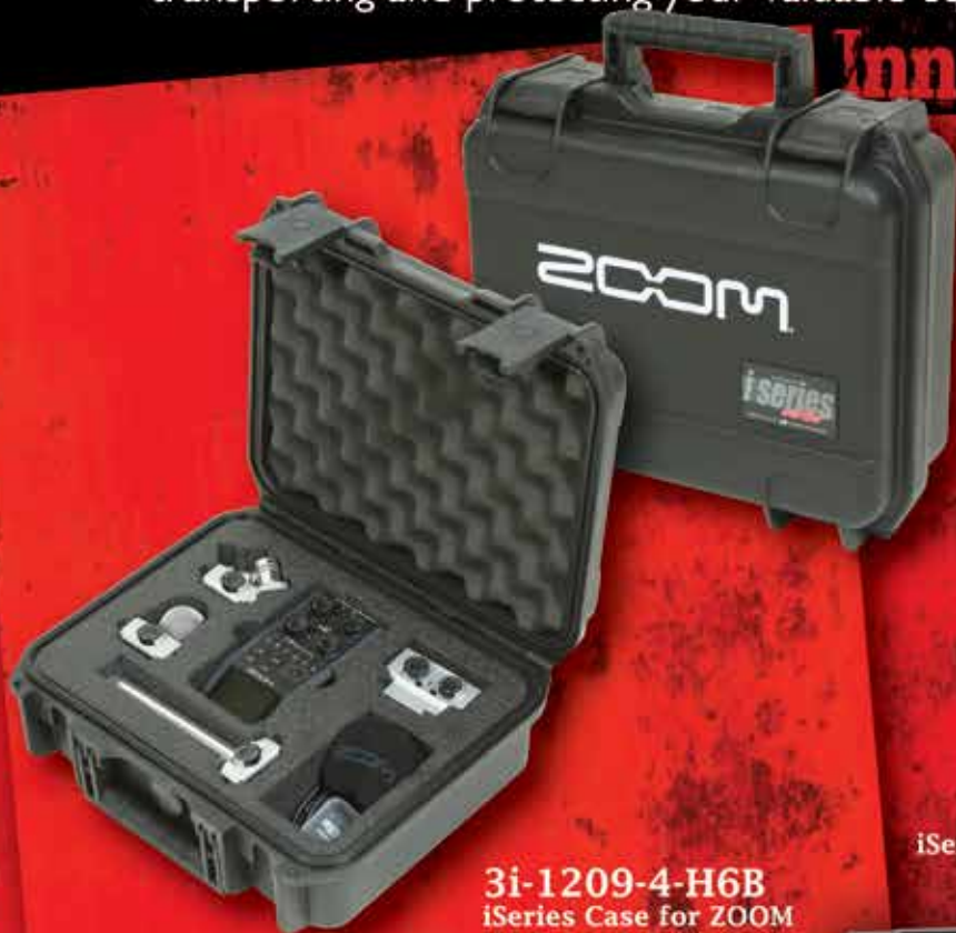
3i-1209-4-H6B iSeries Case for ZOOM H6 Recorder