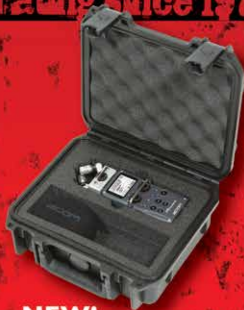
NEW! 3i-0907-4-H5 iSeries Case for ZOOM H5 Recorder