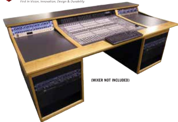
(MIXER NOT INCLUDED)

Sound Construction & Supply, Inc. First in Vision, Innovation, Design & Durability