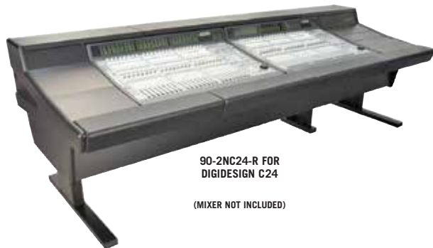
90-2NC24-R FOR DIGIDESIGN C24 (MIXER NOT INCLUDED)

ARGOSY CONSOLE SPECIFIC SOLUTIONS The ARGOSY design, now legendary, has become the archetype solution for Digidesign, SSL, Toft, Mackie, Tascam and Yamaha consoles and control surfaces. They feature precision fit and finish, powder coated components, padded armrests, and trim options. Custom desk configurations and models available. Please call with your specific studio furniture or technical furniture requirements.