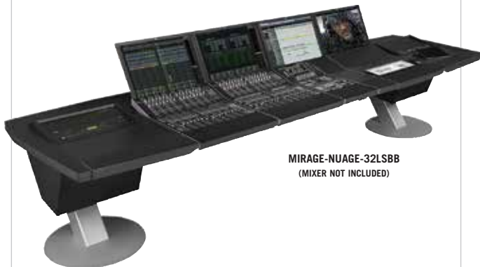
MIRAGE-NUAGE-32LSBB (MIXER NOT INCLUDED)

CALL YOUR SALES PRO TO TALK ABOUT AVAILABLE CONFIGURATIONS, OPTIONS, AND PRICING