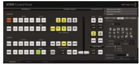
ATEM PRODUCTION SWITCHER SOFTWARE INTERFACE