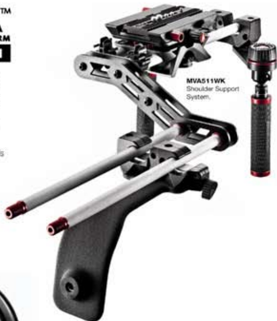
MVA511WK Shoulder Support System.