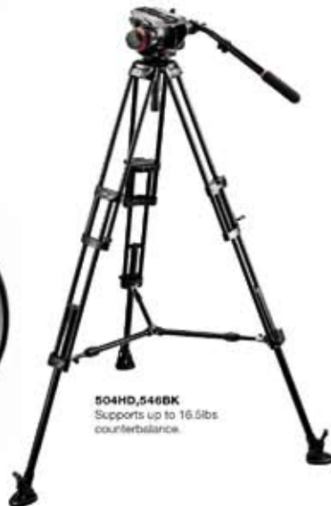
504HD,546BK Supports up to 16.5lbs counterbalance.