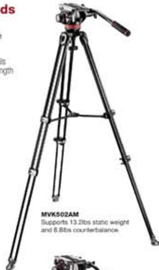
MK502AM Supports 13.2lbs static weight and 8.8lbs counterbalance.