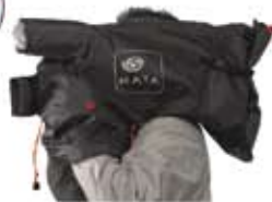
KT VA-801-10 Series of rain covers for video cameras