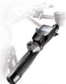
MVR911EJCN Full function remote control for Canon HD/SLR's.