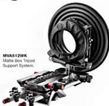
MVA512WK Matte Box Tripod Support System.