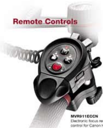
MVR911ECCN Electronic focus remote control for Canon HD/SLR's.