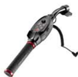
MVR901EPLA Full function remote control for Canon and Sony LANC.