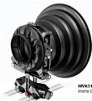
MVA512WK Matte Box.