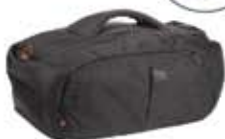
KT PL-CC-(191-197) Protective cases for HD/SLR's & video cameras