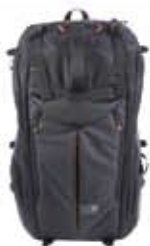
KT PL-PV-610 KATA back packs for video and HD/SLR