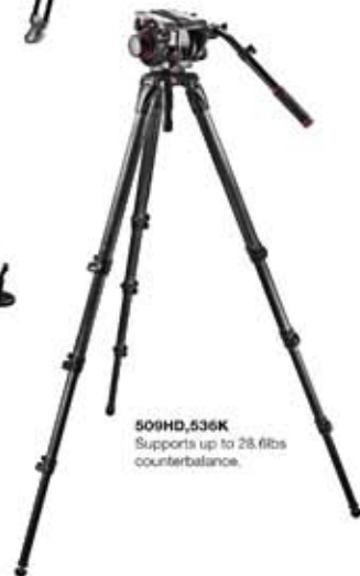
509HD,536K Supports up to 28.6lbs counterbalance.