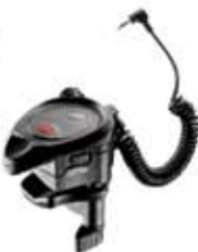
MVR901ECPL Zoom control for Canon & Sony LANC and Panasonic.