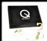
Q the Talent - headworn mic for the budget conscience