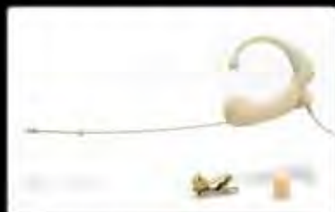
DA12 single ear water-resistant headworn microphone