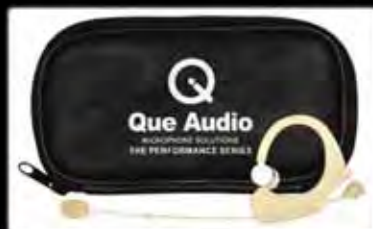
DA15 single ear headworn microphone with in-ear monitor bud

You've known our premium Da-Cappo Microphones... Now Introducing them as... The Q Performance Series