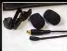
DA04 lavalier micro microphone

FULL COMPASS PRO AUDIO | VIDEO | AV | LIGHTING MUSICAL INSTRUMENTS 800-356-5844 FULLCOMPASS.COM