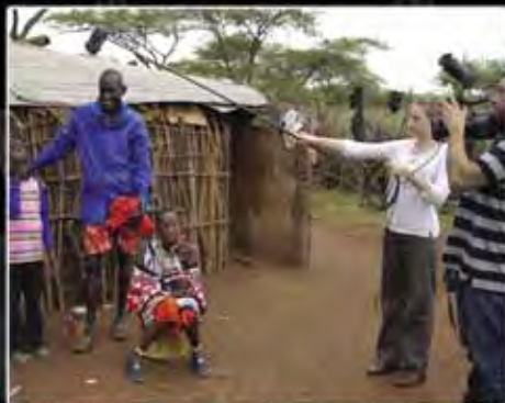
From on-camera run-and-gun to booming location shoots. Anywhere a high quality, compact, lightweight mic is needed.

So... we packaged it in two specific kits for use with HD camcorders and DSLR cameras, or for wherever a Mini Shotgun with superlative audio quality is needed.