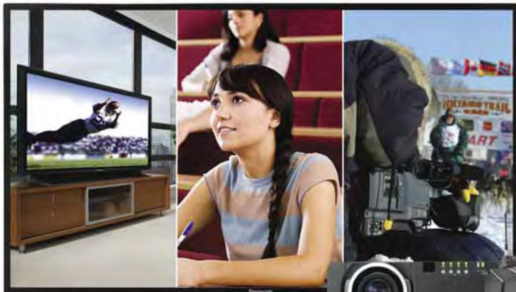
LF Series Full HD LCD