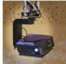
Right Arm w/Projector