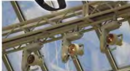
Right Arm w/Lighting Fixture