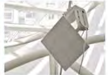
Right Arm w/Audio Speaker