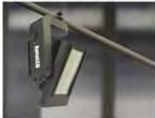
Right Arm w/LED and Scroller