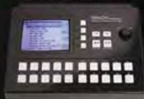
RC-F400S Hot Start Remote Controller