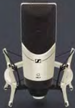
The MK 4 shown with the optional MKS 4 shockmount

Designed and manufactured in Germany, the MK 4 is a true condenser, cardioid microphone that features a one-inch 24-carat gold-plated diaphragm and a full metal housing. Its internal shock mounted capsule enables this versatile tool to be taken from your studio to the stage, and everywhere in between, to capture your music precisely how you hear it.