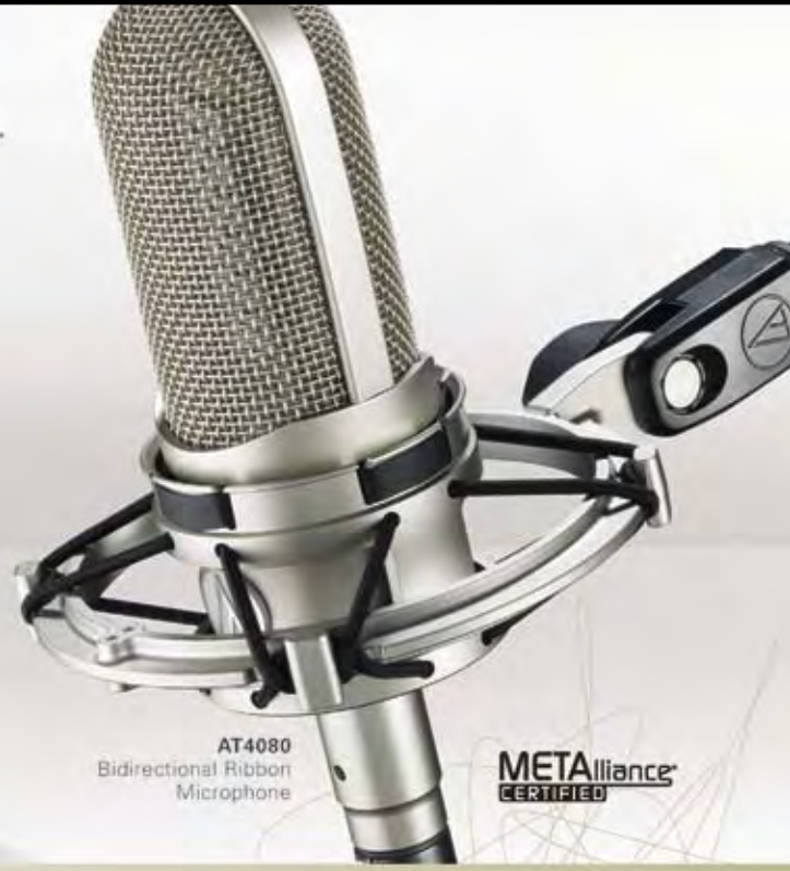
AT4080 Bidirectional Ribbon Microphone