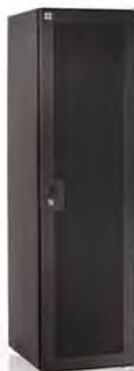
S1 Knock Down Rack