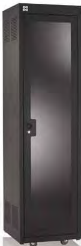
E1 Enclosed Rack