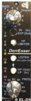
EMPIRICAL LABS ELDS-V-DERRESSER $499.00