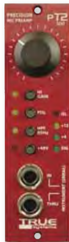
TRUE SYSTEMS PT2-500 $649.95