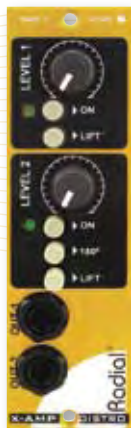
RADIAL ENG. X-AMP $249.99