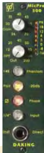
DAKING MIC-PRE-500 $599.00