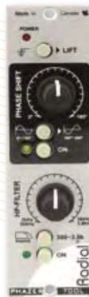
RADIAL ENG. PHAZER $319.99