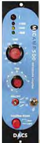
DACS MICAMP500 $1224.00