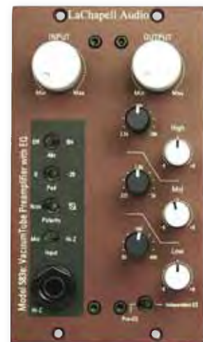
LACHAPPELL AUDIO 583e $1690.00