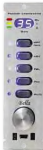
PRODIGY ENG. BELLA $875.00