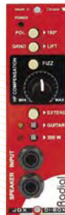
RADIAL ENG. JDX REACTOR $299.99