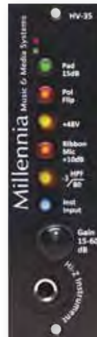
MILLENNIA HV-35 $718.99