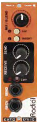
RADIAL ENG. EXTC $249.99