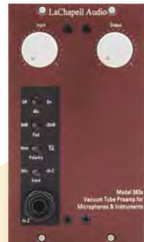
LACHAPPELL AUDIO 583s $1150.00