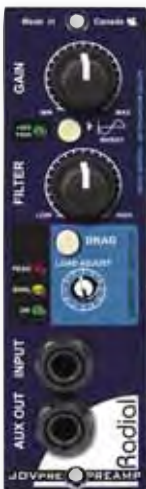
RADIAL ENG. JDV $399.99