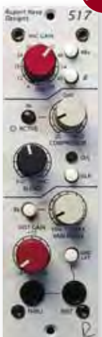
RUPERT NEVE 517 $850.00