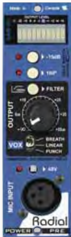
RADIAL ENG. POWERPRE $499.99