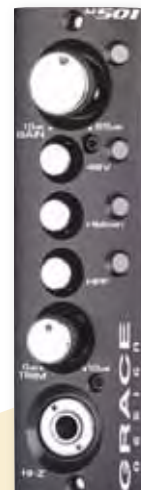
GRACE DESIGNS M501 $545.00