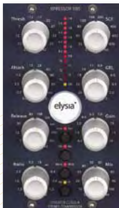
ELYSIA XPRESSOR500 $999.00