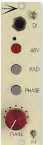
A-DESIGNS P-1 $795.00