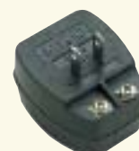
WXF - Transformer